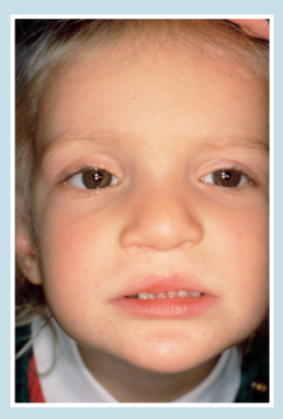
One year after surgery